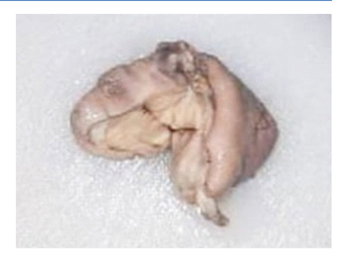
Figure 1: Gross photo of gastric tissue with grey brown mass

Laparoscopic assisted and wedge resection of the tumour showed a 3x3 cm well-circumscribed soft to firm mass present in a lesser curvature of the cardia of the stomach region subserosal in position with no ulceration. A sample was sent for histopathological examination, where it was found to have a subserosal growth in the stomach measuring 3x2x1.5 cm (Figure 1). The cut section was grey or brown in color. Attachment to the normal gastric mucosa was also identified. The microscopic examination of the mass revealed the presence of pancreatic duct acini and connective tissue in the gastric muscularis propria and serosal layer. There was a predominance of benign proliferation of the exocrine portion of the pancreas only (Figure 2). The overlying gastric mucosa and submucosa show the presence of gastric fundic glands, which were histologically unremarkable and showed few chronic inflammatory cells infiltrated (Figure 3).