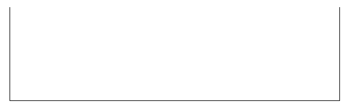
Figure 1: Research framework describing the relationship between service quality dimensions and customer's satisfaction

The model to estimate the impact of service quality on customer satisfaction in parametric form has been defined as follows: