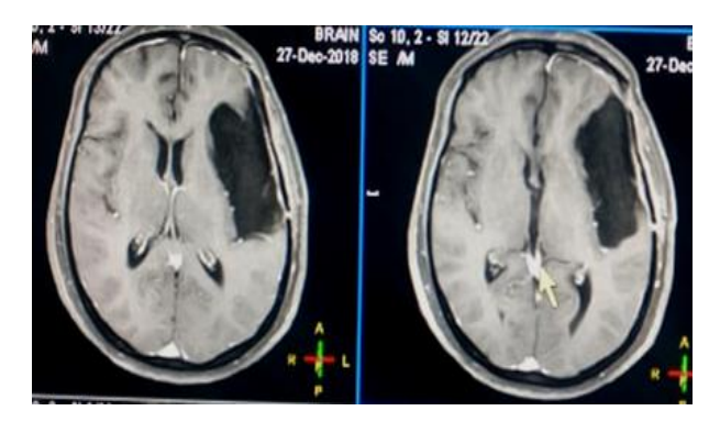
Figure 4: Follow-up contrast enhanced MRI showing no abnormal enhancement.