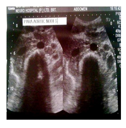
Figure 2: Ultrasound showing large bilateral multiple matted paraaortic lymph nodes.

She was being planned for fine needle aspiration (FNAC) of the frontal mass and also CT guided aspiration of the thoracic mass when she complained of diarrhea with severe pain abdomen. Per abdomen examination revealed multiple firm intraabdominal masses, non-tender, partially mobile with no hepatosplenomegaly. Ultrasound revealed multiple matted para-aortic masses and nodes along the iliac and femoral vessels ( Figure 2 ).