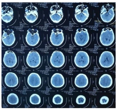
Figure 2: Computed Tomography 8 hours post procedure.

NIHSS immediately after the intervention was 4, and on the following day 2 with a mild dysarthria. The patient was transferred to HDU and was kept in observation for 24hrs and was transferred to Neuro ward ( Figure 3 ). One week after symptom onset the patient reported to have completely recovered.