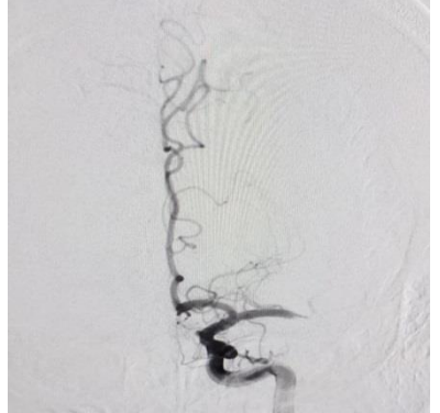
Figure 1: Digital subtraction angiography showing occlusion of M1 segment of Left middle cerebral artery

A 45-year old, right-handed previously healthy male patient presented with an acute right sided weakness and facial palsy to a peripheral hospital (NIHSS on admission: 2). Computed tomography (CT) angiography 12 hours and 20 minutes after symptom onset showed an occlusion of the left MCA in the M1 segment with a large perfusion deficit in the complete MCA territory. He was transferred immediately to the Angio-suite for Digital subtraction angiography (DSA). 4-vessel DSA was performed. The subsequent cerebral distraction angiography (DSA) confirmed the complete occlusion of left MCA in the M1 segment ( Figure 1 ).