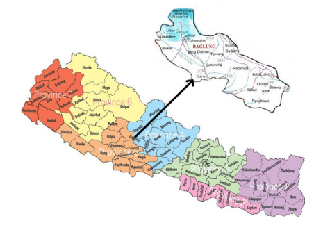
Fig. 1: Map of Nepal with Baglung District.

tropical region with Schima-Castanopsis forest as major natural vegetation. (Chaudhary, 1984). About two third of the land is under rice cultivation in the study area. Almost all rice fields are irrigated, very few cases are rain fed. The cultivation system is based on subsistence farming. Commercialization is very rare. Most of the farmers cultivate local landraces of rice.