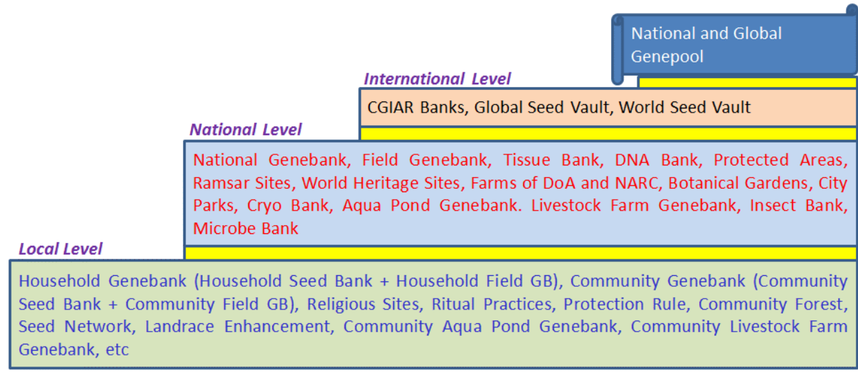
Figure 1. Different approaches and methods for conservation of agrobiodiversity at local, national and global levels (Joshi et al. , 2017a). Temple garden and office garden are additional methods in all these levels.

A concept of conservation ladder is promoted in Nepal, with three steps, local, national and international levels (Figure 1). At local level, there are three main strategies, namely on-farm conservation, in-situ conservation and breeding (Figure 2). Within on-farm conservation, about 15 different methods have been developed and most of them are widely applied in Nepal. Among them, community seed bank and community field genebank are very common and many communities have established for management of local crop diversity.