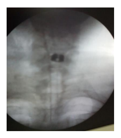
Per-operative C-arm picture