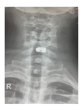
Post operative X-ray