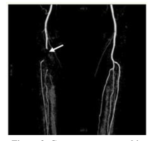
Figure 3: Computer tomographic angiography of low extremities shows occlusion of the right popliteal artery