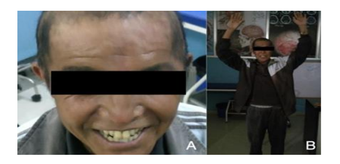
Figure 3: Post- op picture showing no neurological deficit.

past with no proper evidence of complete obliteration of the fistula.<sup>10</sup>