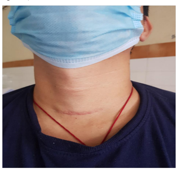
Figure 1: 31 year old male with status post total thyroidectomy, with thyroidectomy scar.

This time (2020/07/08), he was admitted to the department of Internal medicine with the chief complaint of bilateral upper and lower limb tingling sensation, weakness, myalgia, and severe spasmodic pain. At the time of presentation, his physical examination results were normal, except for thyroidectomy scars and carpopedal spasm (see figure 1).