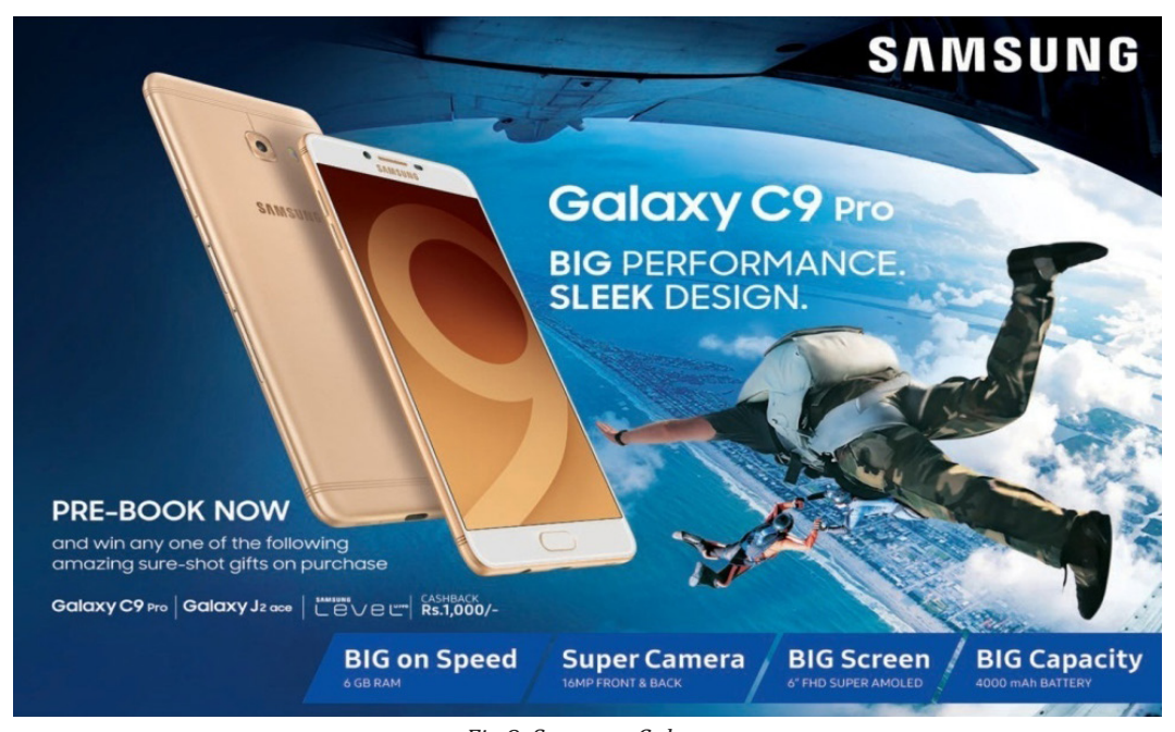
Fig.8: Samsung Galaxy

emotional. The repetition of the word 'Big' stands for emphasis. The parallel structure of the phrases used to describe the features of the upcoming mobile phone is utilized to gain attention. It contributes for cohesion and arguments which become reasonable. Data related to screen, speed, camera and capacity also add much for logical reasoning. Call for pre-booking touches the sentiments of the consumers with the implied message that the product might not be available in market for a longer time.