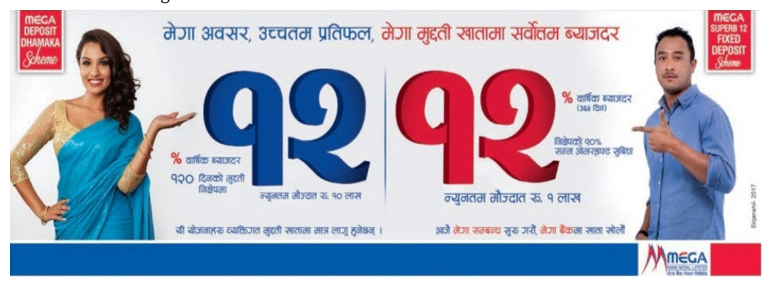
Fig.4: Mega Bank

linguistic feature to motivate audience. The expressive gesture is another positive feature to guide someone to this advert. Even in small space, the advertisement incorporated more information. But, there is also the extended space for persuasion because of the presence of celebrities and facts.