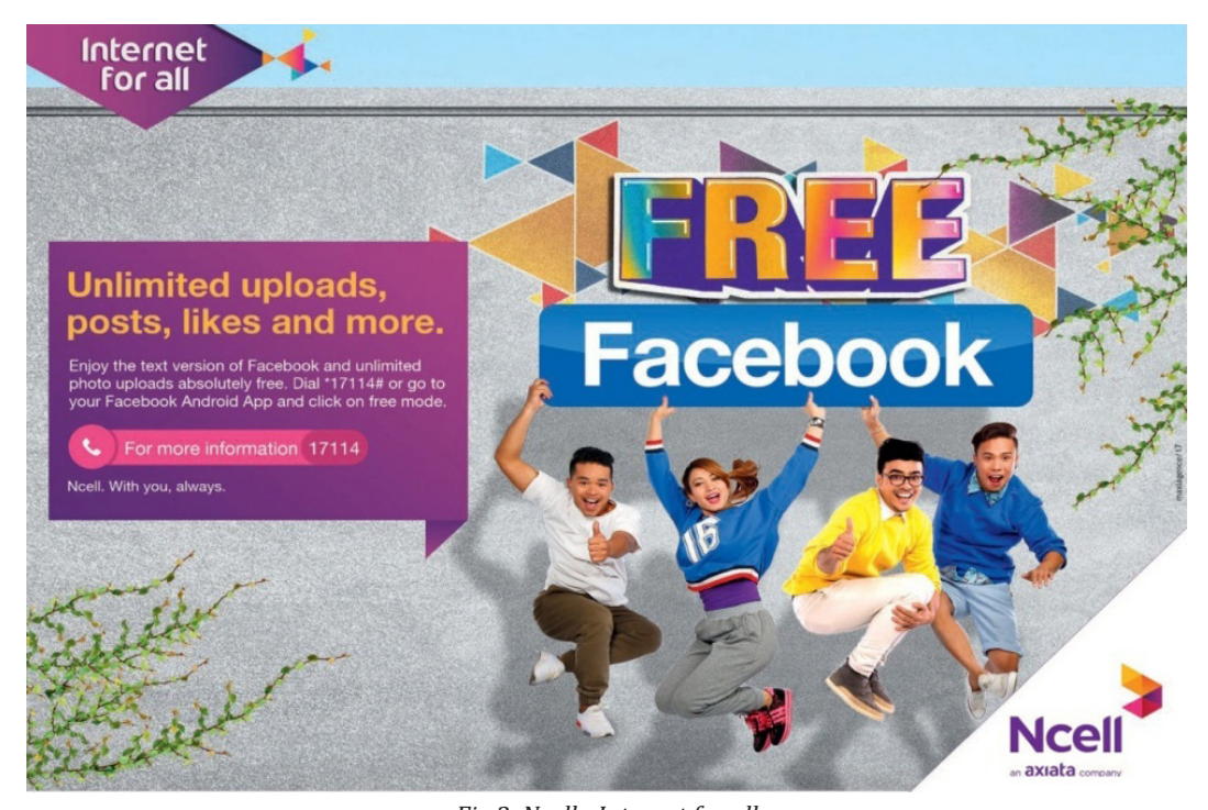
Fig.3: Ncell - Internet for all

With youth marketing strategies, catchy and lucrative features of Ncell are beautifully presented. Rich purple color text box has been used to relay information clearly indicating the brand color endorsed by the company to make the brand more easily recognizable and recalled to the customer besides showing 'Facebook' in its as usual trademark. Audiences could be little skeptical about the proposed service that even by paying people are failing to get better service, how can consumer get such services without paying single penny. The advertisement is also unspoken about the catch up links which are so vital in new-media.