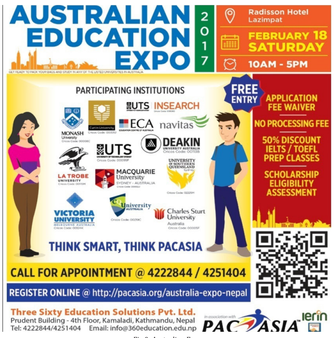
Fig.9: Australian Expo