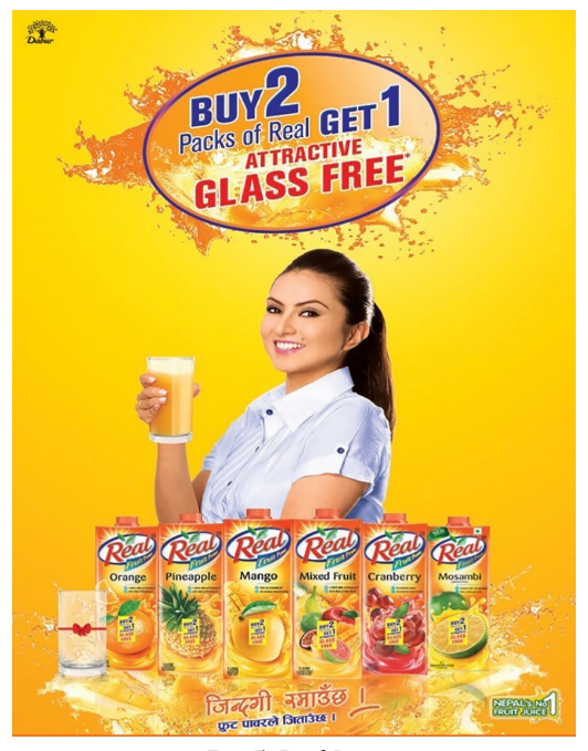
Fig. 5: Real Juice

short worn by her stands for purity. It appeals to credibility that white color is allied with medical field. The flavor of originality is also given by name itself linguistically. It is the matter of sentiment- 'What's in a name?'