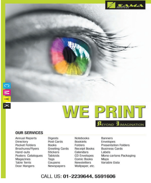
Fig. 7: Sama Printer