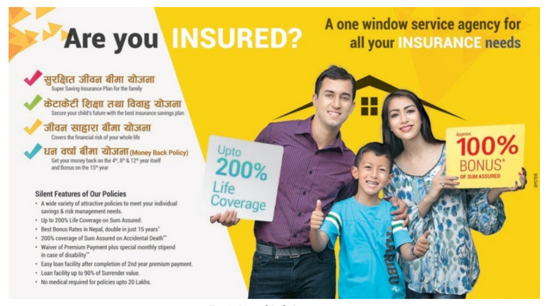
Fig.2: Nepal Life Insurance

and collective decision. Major features of policies are listed in points to communicate to consumers fairly. The one window service as claimed serves a motivation to buy policies which avoid unnecessary hurdles. Projecting a card, a lady assures hundred present bumper bonuses of the sum assured to make it reasonable but small letter approx at top confuses audiences. Psychologically, the previous rhetorical question, while reading between lines, tells that no one can be insured without insurance.