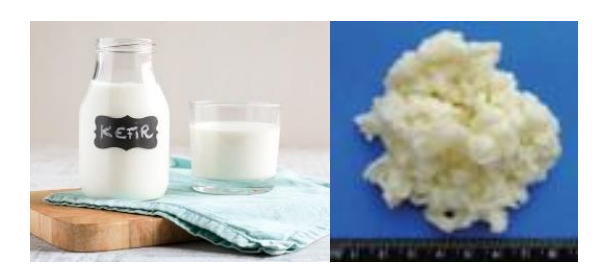
Figure 1: Kefir produced from milk (left) and kefir grain (right).

The diverse microbial community of kefir includes lactic acid bacteria like Lactobacillus species (e.g., Lactobacillus kefiranofaciens ) and Streptococcus species, as well as various yeasts such as Saccharomyces cerevisiae and Kluyveromyces marxianus (Garofalo et al., 2015). Working collaboratively, these microorganisms break down lactose and other milk constituents, producing lactic acid, acetic acid, ethanol, carbon dioxide, and various volatile chemicals that contribute to kefir's distinctive flavor and aroma while maintaining its original color (Figure 1) (Zamberi et al., 2016).