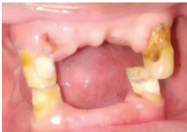
Figure 1: Initial situation

Teeth arrangement was done and evaluated in the patient's mouth for phonetics, vertical and centric relation, and esthetics (Figure 6). Vertical dimension was verified and also centric and eccentric contacts were checked. Patient's approval was taken, and the curing of the final denture was done in acrylic resin (Trevalon, Dentsply). The denture was cured, polished and inserted. Clear post-insertion instructions regarding denture and abutment teeth were given to the patient. Post-insertion adjustments were made after 24 hours. The patient was recalled for periodic follow up.