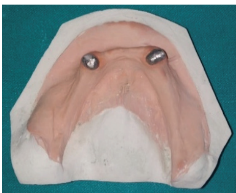
Figure 3: Short coping fabrication