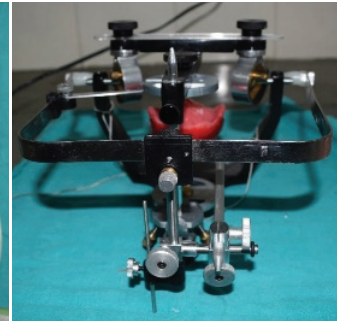
Figure 5: Face bow transfer