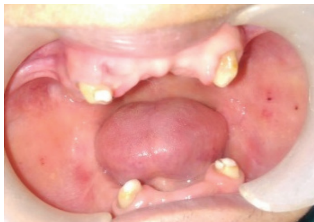
Figure 2: Tooth preparation