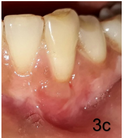
Figure 3a, 3b, 3c: Post-operative 1 month, 3 months and 6 months.

Surgical procedure: After proper isolation, the operative site was anesthetized using 2% Lignocaine with 1:100,000 adrenaline. Modified surgical approach for isolated recession i.e. laterally moved, coronally advanced flap by Zucchelli5 was performed. The recipient site on 33 was prepared and donor site was planned from 32. A full thickness flap up to the mucogingival junction and then a partial thickness flap was raised by leaving marginal gingiva from 32 in order to slide the flap laterally and coronally to cover 33 (Figure 2a). The graft was secured with 4-0 non-resorbable silk suture and covered with Coe-Pak (Figure 2b, 2c).