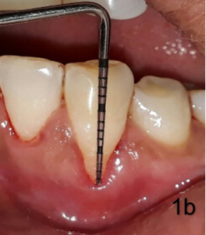
Figure 1a, 1b: Pre-operative view.