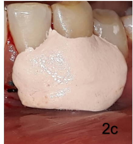
Figure 2a, 2b, 2c: Operative view.