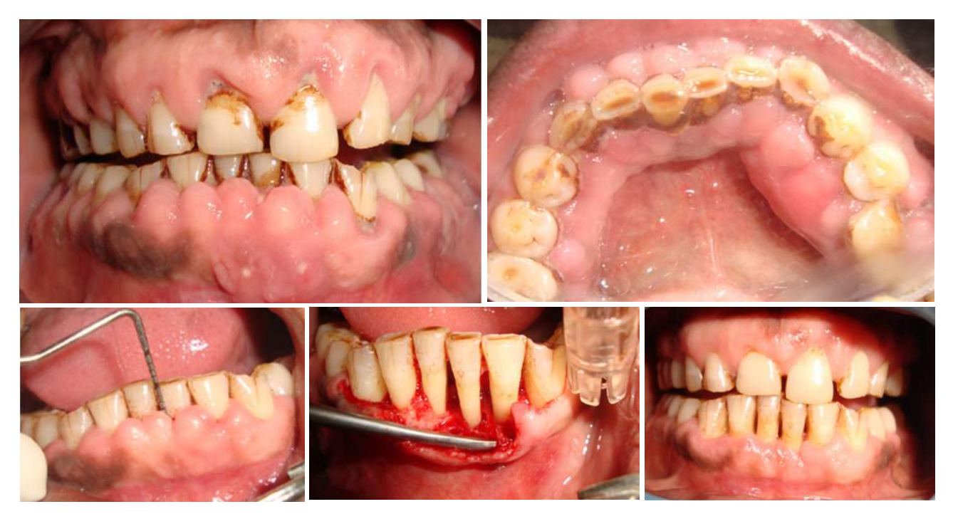
Figure 5: After nonsurgical and surgical therapy (Periodontal pocket depth (31) = 5-6mm).

and undisplaced flap technique for periodontal pocket reduction in lower anterior incisal region and external bevel gingivectomy where there was no bone loss as it was a combined type of enlargement.