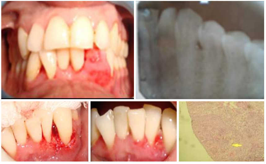
Figure 1: Pyogenic granuloma excision and histopathological picture.

A 63-year-old female from eastern part of Nepal presented with localized painless enlargement in upper arch proximal to gingival region of right canine and premolar measuring 1x1 cm in diameter. Bleeding on minor trauma and discomfort on eating and tooth brushing was experienced. Being a smoker, the patient worried of malignancy. Any systemic disease, medication, or allergy were not seen. Lymph nodes were not