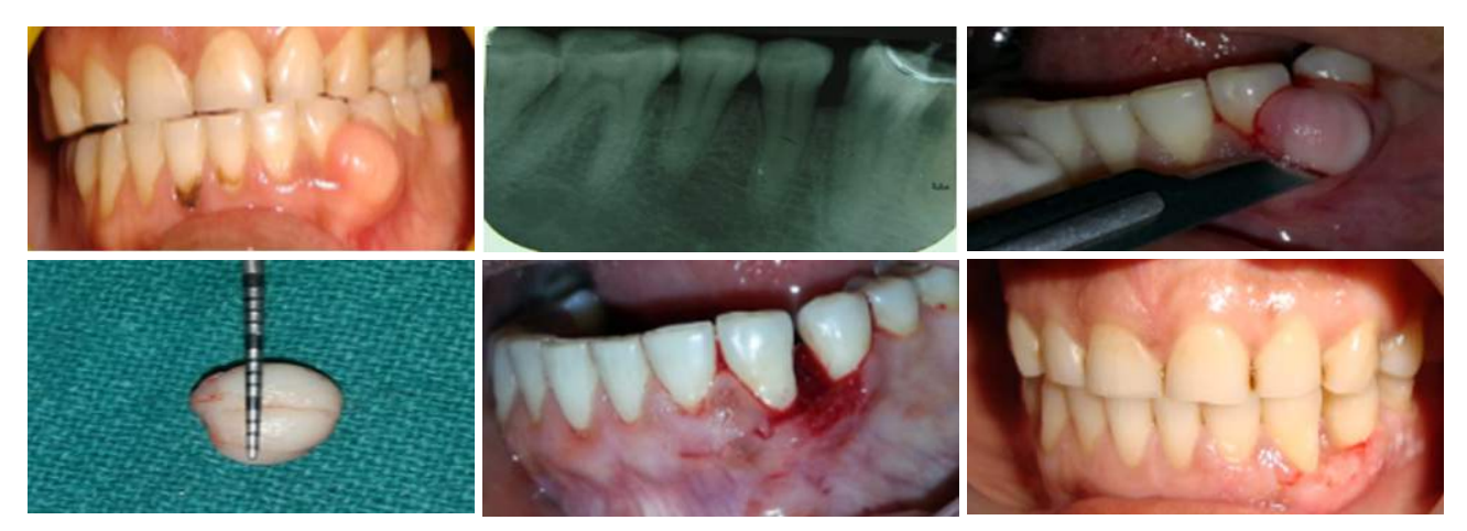
Figure 3: Excision of gingival enlargement (pre and post photographs).

palpable. Erosion of teeth with plaque and calculus deposit was found. IOPAR revealed no abnormal finding. Treatment consisted of smoking cessation counselling and four visits of nonsurgical periodontal therapy. Excisional biopsy of the enlargement sent for histopathological assessment revealed chronic inflammatory lesion with no dysplasia.