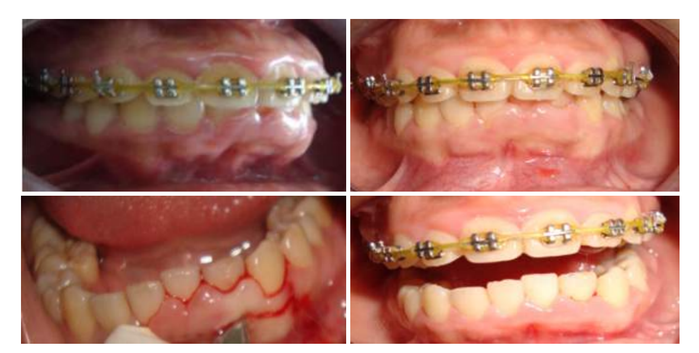
Figure 6: After surgical excision and healing.

overgrowth developed after decrowding of lower anterior segment which caused an aesthetic and functional problem. She had incompetent lip seal and habit of mouth breathing. External bevel gingivectomy was planned which was carried out with Kirkland knife after few visits of nonsurgical therapy.