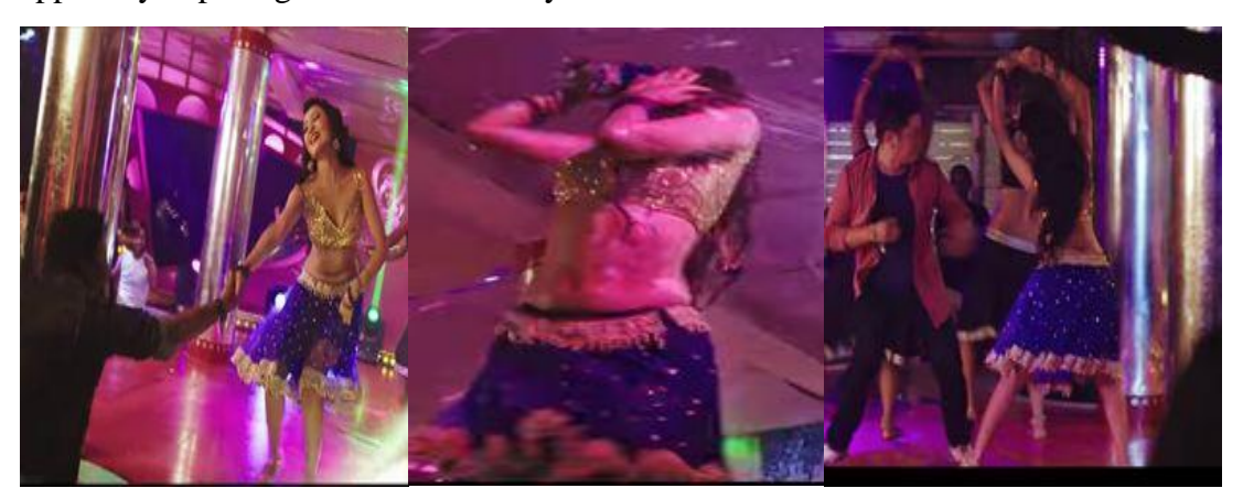
Figure 4. 1:00-2:32

Likewise, in the dance on "Thamel Bazaar," the actress creates the impression of overtly glamorized woman who intends to seduce the males by whom she is surrounded with. Since women are bound to look glamorous, in this dance, the girl seems to be guided by the belief that she needs to beautify herself for getting reward from the males. Butler suggests to understand the stylization of the body as the mundane way in which bodily gestures, movements, and styles of various kinds constitute the illusion of an abiding gendered self (191). Butler argues that gender is created through surficial inscription on the body. Therefore, when she makes her entry in the bar, she looks dazzling, proving that she has inscribed beauty in her body. She has ultra-thin and shinning body consisting of the parts such as bust, waist, and hips that seem to follow the measures set by the beauty industries confirming that "Hourglass figure, emphasizing breasts, and hips against wasp waist, is an intelligible symbolic form of sexualized ideal of femininity" (Bordo 181). The girl makes sex appeal by exposing her sensuous body: