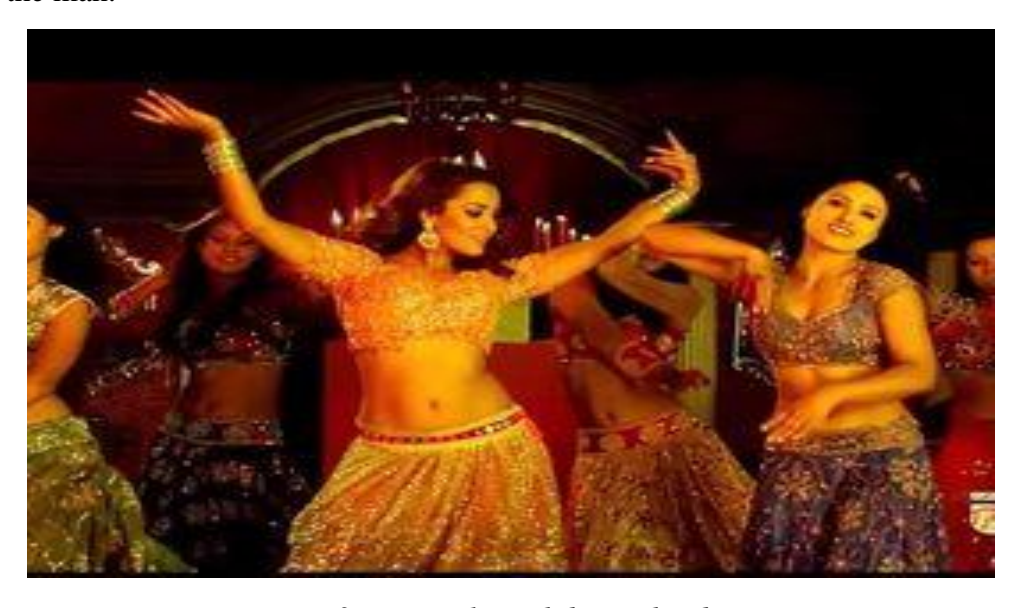
Figure 3. item girl is exhibiting her beauty

She claims that people are fan of her beauty. They compare her countenance to the sun and the moon. Since her face is as bright as sun, they call her sunshine. Likewise, they call her moon when they find her countenance as attractive as lunar. Furthermore, she acknowledges herself that she is a volcano. Within her, there are various mines of valuable metals like copper, brass, and pure gold. Therefore, she is beautiful enough to lure the man.