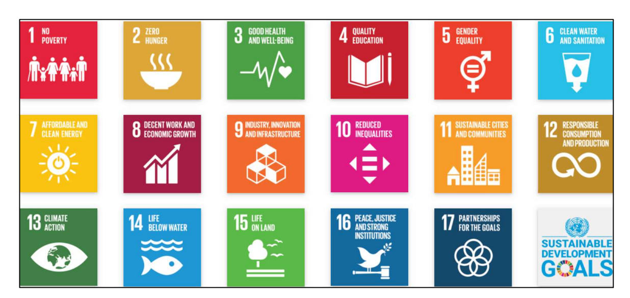
Figure 1: SDGs adopted by the United Nations

Forest conservation has been an important agenda in Nepal since long. Strict regulations were implemented and the conservation efforts in Nepal have become quite effective lately with forest area being increased to 44.74% (MFSC, 2017). However, the regulations are regarded as challenges by the people working for development. Project managers of many construction projects often blame that forest clearance is one of the most critical factors for the delay of the projects. Irrespective of the scale of deforestation and urgency of the project, every project has to get an approval from the Nepal government cabinet for cutting even a single tree. The process is quite lengthy and goes for years. For instance, Dang section of the Postal road project, which is a national pride project, was waiting for the forest clearance for at least three years (based on a discussion with the project authority). It is widely realized that rules are not only harsh but also irrelevant in many aspects.