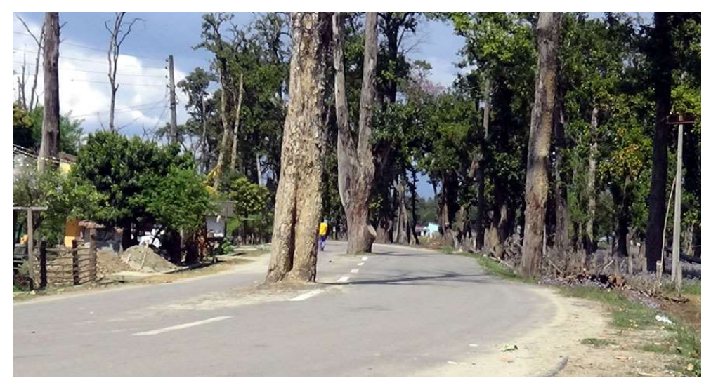
Figure 2: Road blacktopped in Dhangadhi without removing trees from the pavement (Bist, 2020)

The implementation of the forest act is based on qualitative grounds, and hence, the scale or extent is not a focus. For instance, the total forest land handed over to infrastructure projects during 10 years from 2006/7 to 2015/16 was 2137 hectares with a yearly average of 213.7 hectares (Sharma, 2017). The forest land handed over for infrastructure projects during a decade accounts for 0.0145% of the total land area of Nepal. At this rate of deforestation, it will take approximately 690 years for the forest area to deplete by 1%. For the forest area to deplete from 44.74% to 44%, this rate will take more than 500 years. Moreover, the Forest Investment Program aims to rehabilitate 10000 hectare of degraded forest in 8 years with an average of 1250 hectares per year (MFSC, 2017). The planned 1250 hectares per year of conservation is 5.8 times the 213 hectares per year of forest area handed over to infrastructure construction. This data and the encouraging forest cover growth rate of 0.89% in recent years illustrate that Nepal is witnessing net forest gain in recent years despite small loss caused by infrastructure development. Estimation of optimum forest area for Nepal could provide confidence and a means to simplify the process of handing over the forest land for infrastructure development aimed at achieving SDGs.