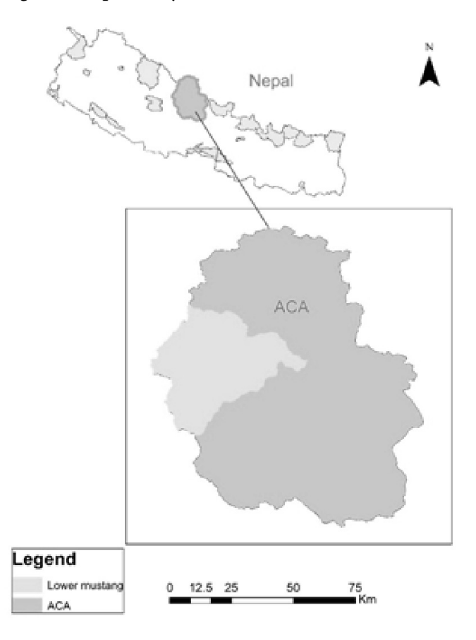
Figure 1: Map of study area

The site encompasses multiple villages with around 1000 inhabitants approximately that largely engage in agriculture and tourism as the main income source. Annually, Mustang welcomes around 68,576 visitors and is one of the main tourism destination sites in the ACA region. Every year, a large number of visitors from across the globe visit Mustang for trekking, to enjoy the panoramic view of mountains, for research, for wildlife photography, and to visit religious sites.