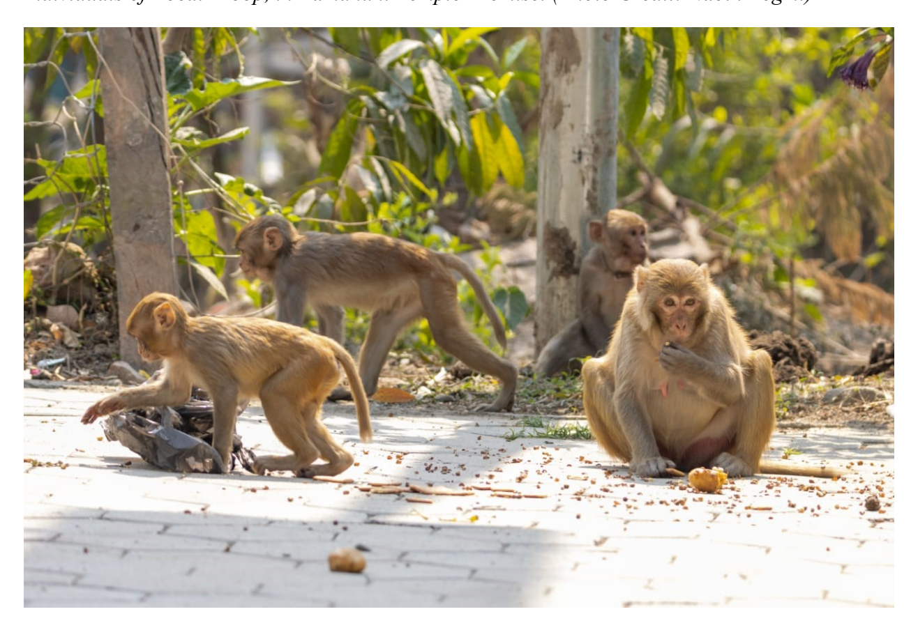
Figure 2 Individuals of Focal Troop, in Ramdhuni Temple Premise.

30.0% in resting and 15. 9% in travelling but in winter, adult females spent 35.4%, in feeding, 39.7% in resting and 8.0% of time in traveling (Zhenwei et al., 2015).