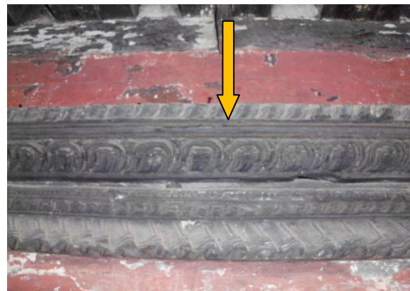
Fig 6 Wooden lintel band