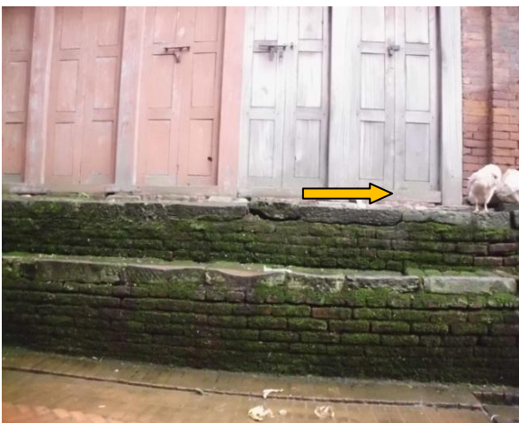
Fig 3 The plinth provided in a building