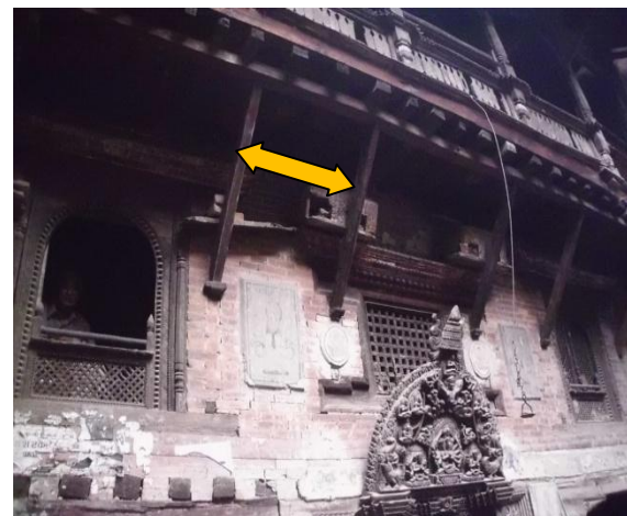
Fig 4 Struts