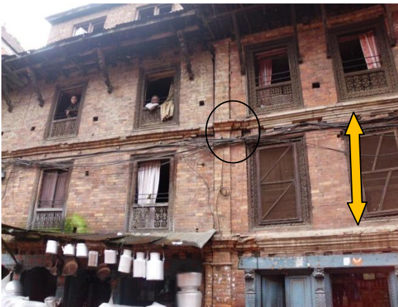
Fig 1 The storey height of building

conduct their manufacturing industry in the chhendi so the massive load is not caused by the upper stories. The openings in the upper stories are smaller so the stiffness criterion is well met in the traditional unreinforced masonry buildings. The wall of chhendi is found to be provided with 9” thickness and the upper storey walls have thickness of 4.5” hence this ultimately reduces the probability of exceedence of upper storey dead load. Most of the openings were found to be double framed which is taken as significant during resistance of lateral earthquake forces. The small openings in such buildings have their role in preventing soft storey effect thereby assuring stiffness to the structures.