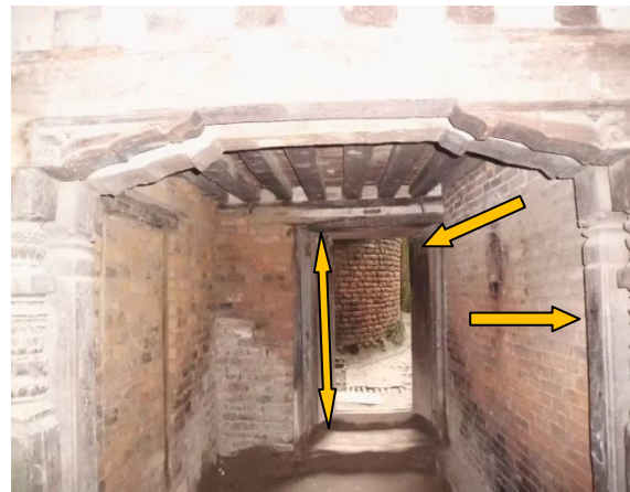
Fig 2 Double framed door openings