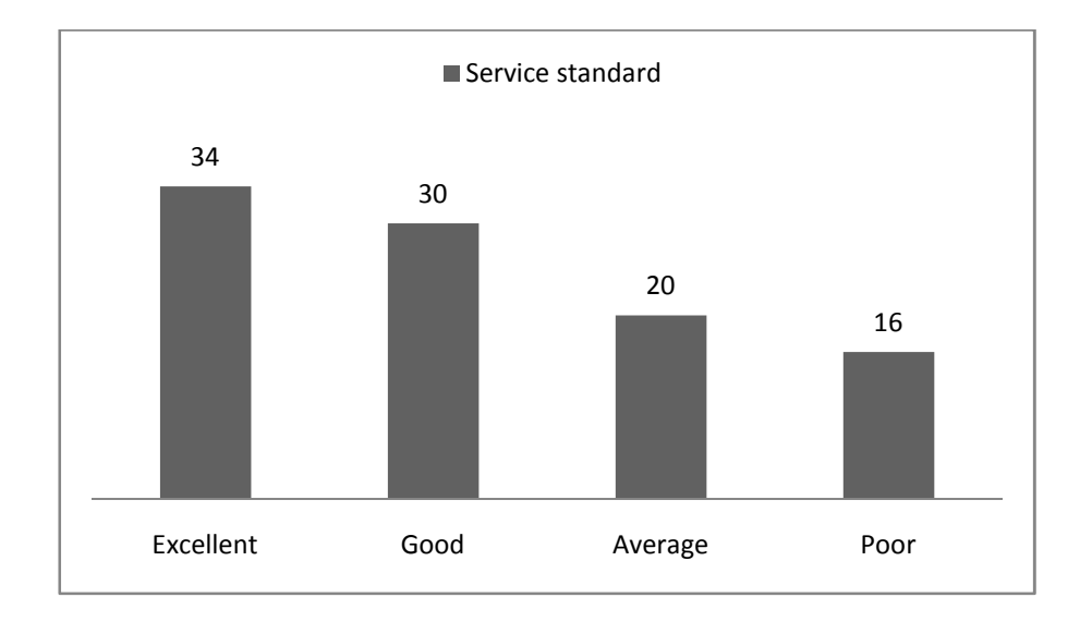
Figure 1 Service Standard in SNLIC