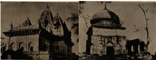
Fig1 Temple Architecture of Mithila

Mithila's architectural heritage, evolving from early absence in Maithili works to later featuring temples made of perishable materials, reflects a dynamic history shaped by rivers and natural calamities. Floods, especially from the Koshi and Balan rivers, led to the demise of cities. Limited standing monuments and scientific exploration hinder the study of ancient Maithili architecture. From the 15th century, temple records influenced by Indo-Islamic art emerged, surviving in dilapidated conditions. Literary works describe structures made of stone and later brick during the Karnata and Oiniwara dynasties. Abundant alluvial clay facilitated brick production, with fired clay bricks forming the primary material for structures. Stone was sparingly used, and Mithila's temples, dedicated to deities like Siva and Vishnu, predominantly feature brick construction. The art and architecture showcase diverse temple types, including the Sikhara type, with ancient Siva temples having a unique Garbhagriha below the surface. Stone temples are rare, with evidence found at Bhit-Bhagwanpur. Mithila's art, primarily religious, exhibits exquisite temple facades with ornamental styles and intricate decorations, reflecting a romantic attitude.