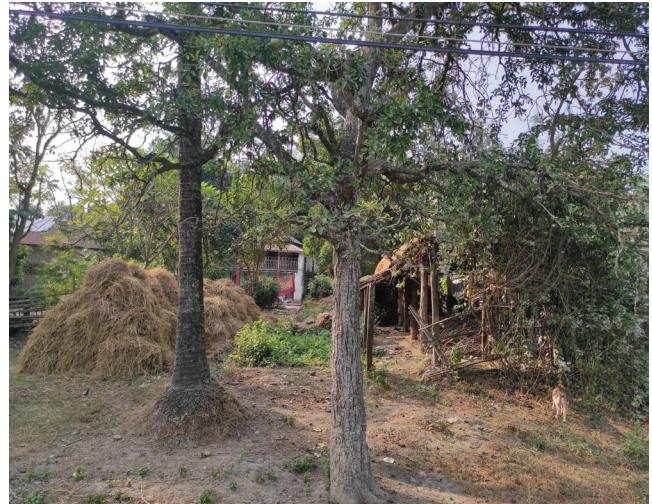
Fig. 2 Tej Prasad House

In the examined cases, it becomes evident that a predominant orientation choice for buildings is toward the east, while a deliberate avoidance of south-facing structures is noted. This practice aligns with Vaastu's beliefs, where the orientation of a building is considered crucial for positive