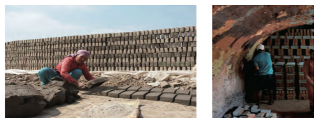
Figure (Fig. 2): Traditional Brick Industry

Additionally, the timber and bricks used in these structures are quite unique in nature. The bricks used are called m\bar{a}ap\bar{a} and d\bar{a}tiap\bar{a} .<sup>20</sup> They are traditional fire bricks, the production of which, although declining, is still in existence today.