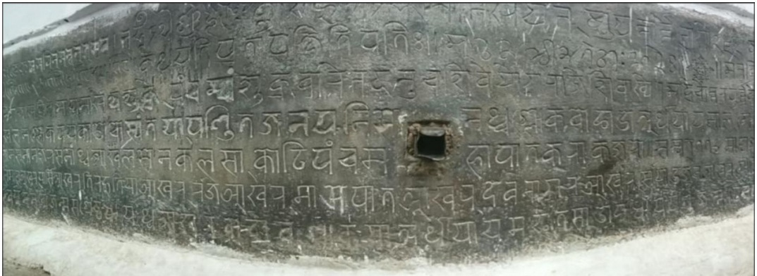
Photo no. 4, Photo of wall painted mäne mantra in Ranjanā script in monastery