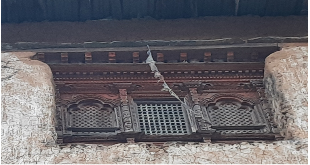
Photo no. 1: Typical Newārī Style Wooden window of Chi Phug Gumbā of Tsum valley and Hanumandhoka, Kathamandu