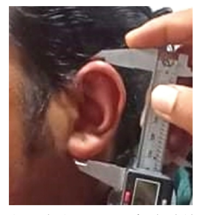
Figure 2: Showing measurement of total ear height.