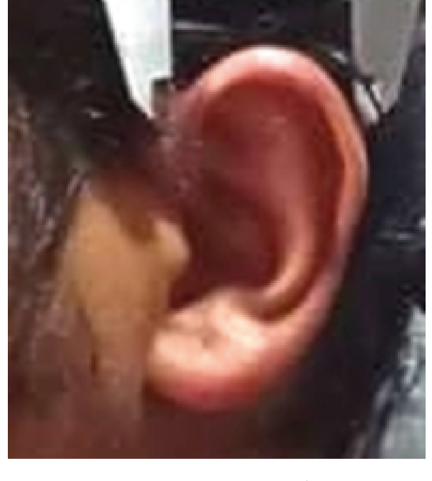
Figure 3: Showing measurement of ear width.

Table 2 shows the descriptive statistics of the ear variables evaluated and measured on both right and left sides with the degree of symmetry analyzed using the paired t-test.