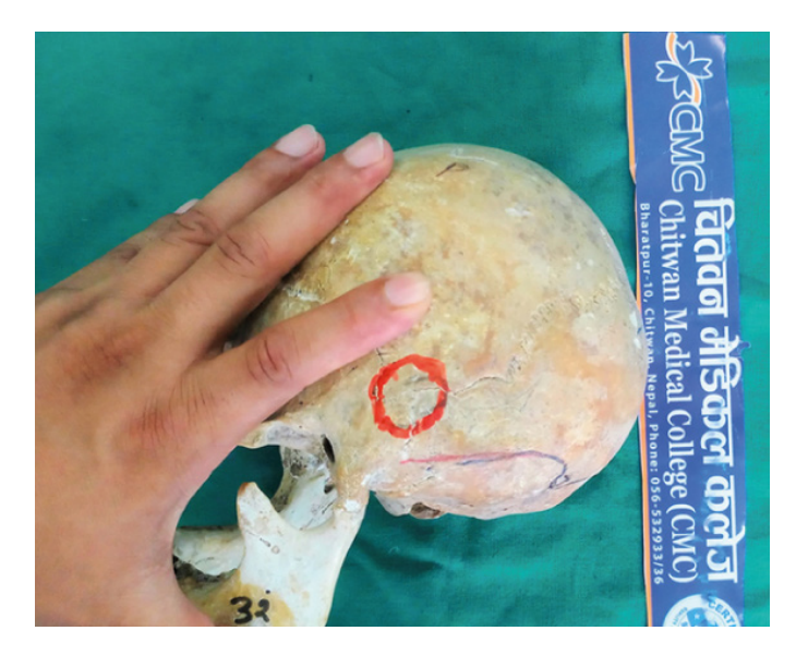
Picture 2. Photograph of Skull Showing Type II (incomplete) Asterion.