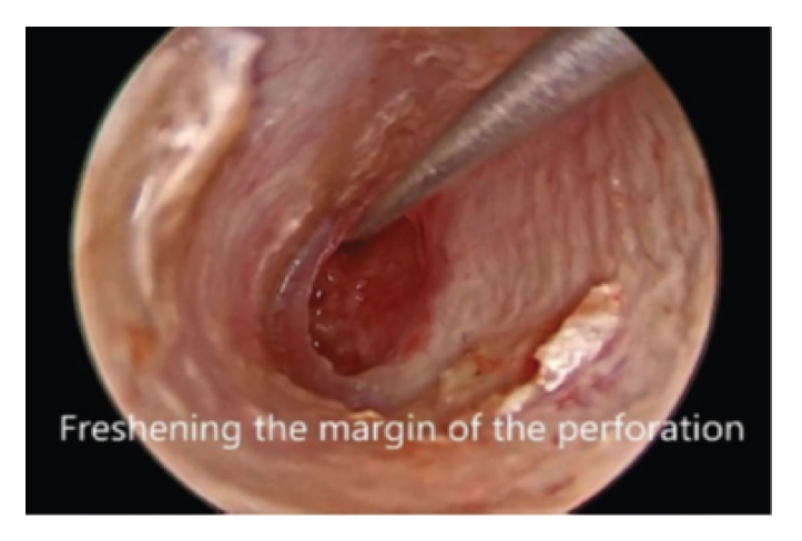
Figure:3(Freshening of Perforated Margin) MedPhoenix: JNMC - Volume 7, Issue 1, Aug 2022