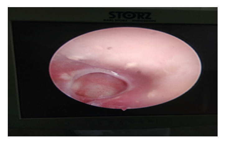
Figure:2(Endoscopic Visualization of TM Perforation)