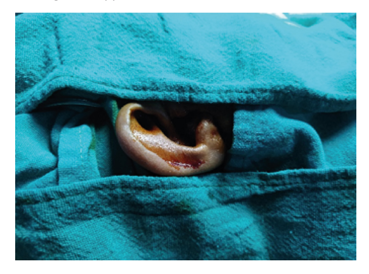
Figure:1 (cleaning and Draping)

end of perforation by mounting on the crocodile forceps. Then, the rest of the cartilage was placed in the middle ear with a straight needle(Figure6). The canal was then packed with wet gelatin sponge soaked in ciprofloxacin ear drops and followed by the ribbon pack medicated Myosporin ointment was kept in the canal, and the bandage was applied.