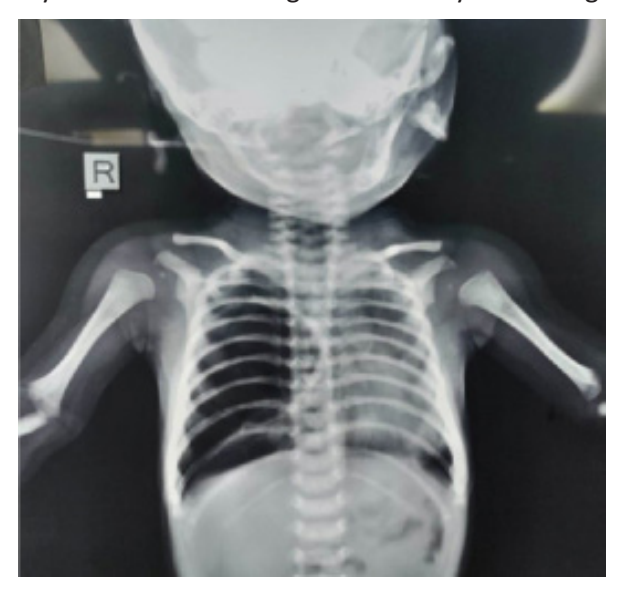
Figure 1: Chest X-ray of patient with congenital pulmonary malformation

Patient was planned for open right thoracotomy with posterolateral approach. At surgery, the malformation was seen involving upper and middle lobe following which upper and middle lobectomies were carried out and the specimen sent for histopathology (Figure 3). He has an uneventful postoperative course. Patient was extubated on 2<sup>nd</sup> POD with complete resolution of respiratory distress by 4<sup>th</sup> POD. Feeding was started on 6<sup>th</sup> day and he was discharged on 11<sup>th</sup> days after surgery.