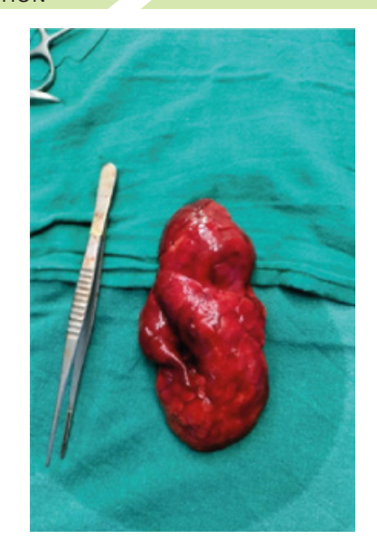
Figure 3: Excised right upper & middle lobe showing a large cystic cavity