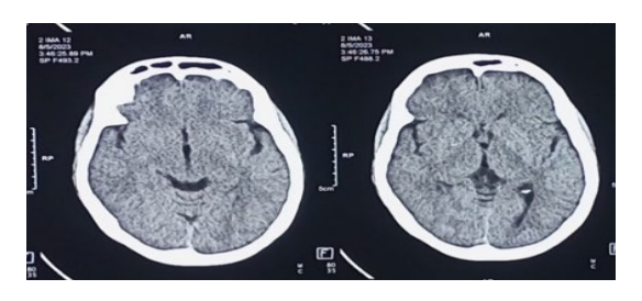
Fig. 2: NCCT Head with mild cerebral atrophy.

Non-contrast Computed tomography (NCCT)scan was done to find out other cause of alter sensorium.