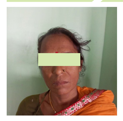
Fig. 1: Patient with Sheehan's syndrome.