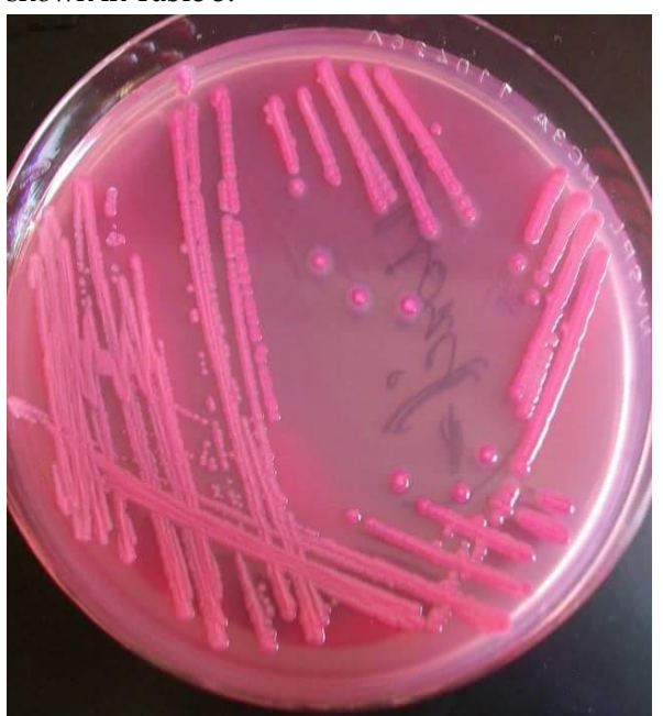
Fig 2: Media plate showing growth of E. coli

Among the total growth positive isolates, the highest number of organisms was found to be Escherichia coli (35.4%) followed by COPS (Coagulase positive Staphylococcus) (22.9%), CONS (Coagulase negative staphylococcus) Saprophyticus) (18.7%), Group D Streptococci (10.4%), Enterobacter spp (2.1%), Klebsiella oxytoca (2.1%), and Proteus mirabilis (8.3%) are as shown in Table 3.