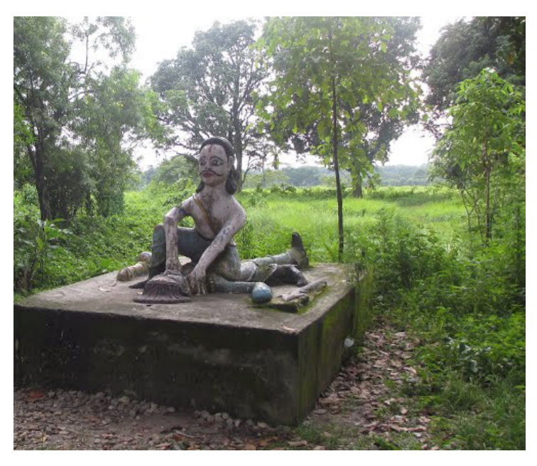
Fig.1. Local people revere their heroic character Bhimsena, offer flowers and bow here for his might and victory over Kichak. The modern image gives a quaint impression of interference in this archaeological site. (pic taken in 2018)

Kichakbadh lies in Prithvinagar metropolis formerly called Maheshpur now in Bhadrapur village municipality by the south -western banks of the Deunia river. It is spread over 10 bigaha of lands, which is itself a mound. This mound has ruins of fences, house-structures resembling palace, and monuments linked to intangible value so it is regarded as an archaeological site. On the mound, there is one spot where a modern idol of Bhima sitting on the chest of another idol, who is undoubtedly Kichak is the prime site of the whole mound. (Fig.1). Since 2002, under the leadership of archaeologist Uddav Acharya series of excavations have been conducted in the mound.