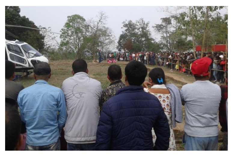
Fig. 2. Helicopter landing in sensitive conserved area inside of an archaeologically protected site in Kichakbadh among excited visitors -2019, Feb. 17.

An annual festival called Maghe purnima is held in the site. Preparations are heavy and hasty that begin months prior to the festival. Traders from nearby hilly areas and India assemble and start preparing for temporary make shift settlements in and around the sites. As there are no hotels and inns, the small mound of Kichakbadh seems dangerously tiny and vulnerable amidst mass of more than 2-3 lakhs of people who assemble during the one day festival. Thousands and thousands of people attend the yearly festive in the month of Falgun . (on Full-moon day). This has changed the destination image of Jhapa and called on urgent measures to protect it from effects of human activities, management loopholes (Fig-2) and safeguard this cultural property from natural disaster like river-floods too.