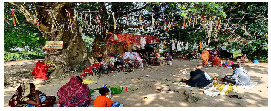
Fig 10 The Devotees come with various purposes, however belief is devotion to Sami Mai

The majority of the pilgrims who visited here seem to be very devoted and had a strong belief that Samai Mai would grant their wishes. The belief of offering bells and clay terracotta elephants all around the premises shows that their boons have been granted. Hence the researcher concluded that bio-psychologically Samai Mai played a significant role in providing a high level of life satisfaction both at the personal level and the psychological level by giving fewer places for traumatic situations. It helped in their well-being which may lead to happiness, and healthy, and stable family life, affecting strong bonds in a marriage that may result in well-behaved children. Such religiosity may also decrease domestic abuse and also addictions (This aspect is open for further research) Thus the Bio-psychological aspects were fulfilled