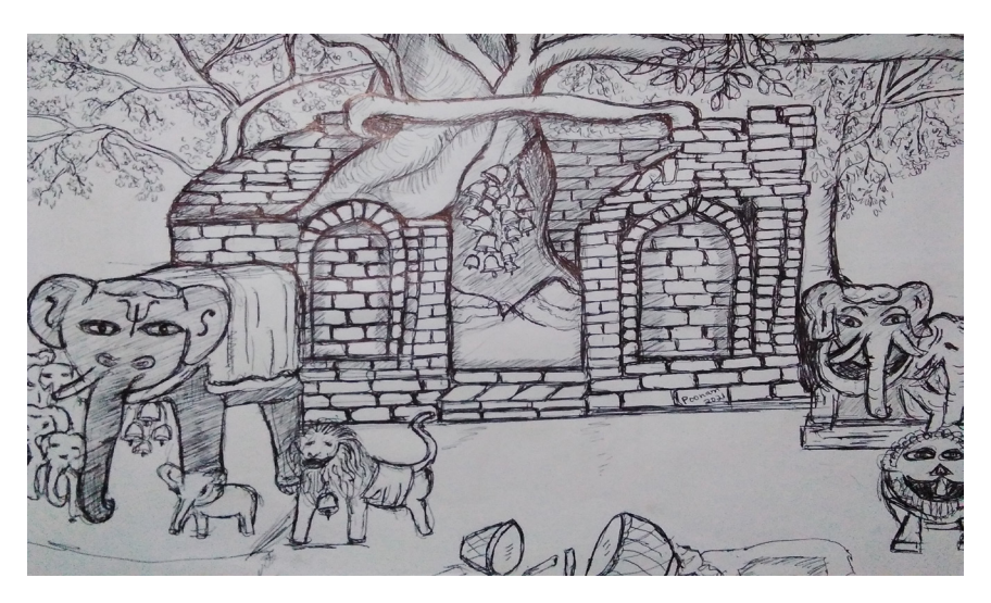
Fig 8 Offerings of bells, elephants a sketch by the researcher (March 2021)

The majority of the pilgrims who visited here seem to be very devoted and had a strong belief that Samai Mai would grant their wishes. The belief of offering bells and clay terracotta elephants all around the premises shows that their boons have been granted. Hence the researcher concluded that bio-psychologically Samai Mai played a significant role in providing a high level of life satisfaction both at the personal level and the psychological level by giving fewer places for traumatic situations. It helped in their well-being which may lead to happiness, and healthy, and stable family life, affecting strong bonds in a marriage that may result in well-behaved children. Such religiosity may also decrease domestic abuse and also addictions (This aspect is open for further research) Thus the Bio-psychological aspects were fulfilled