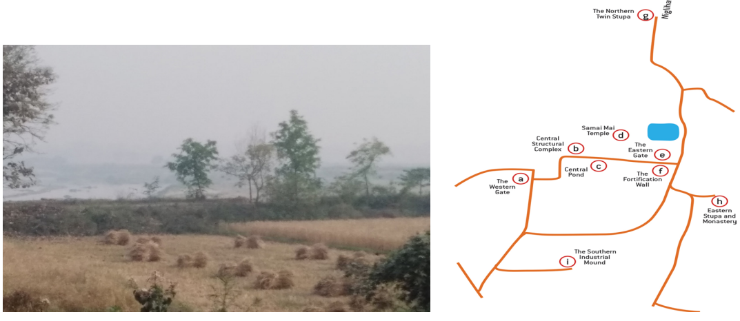
Fig- 2 Fig 2b

Tilaurakot lies within the Southern Terai of Nepal. It is taken into consideration to be the historic Republican nation of the Shakyas, where, Lord Siddhartha spent 29 years of his life. It is situated 27 km West of Lumbini on the East bank of river Banganga. It is positioned 3 km North of town Taulihawa on the Eastern bank of river Banganga. Today it lies in the Lumbini, Province 4. (WHS, with the aid of using Govt of Nepal, 1996)