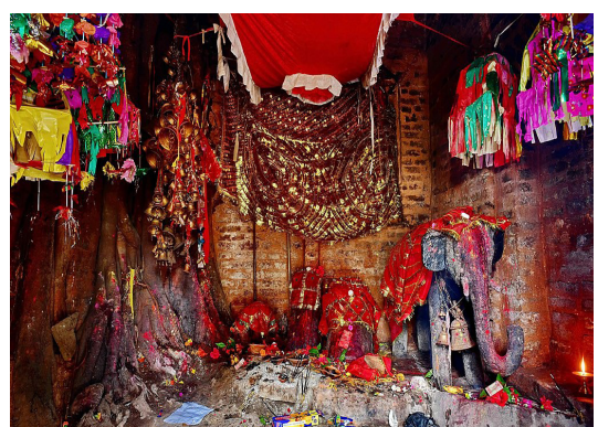
Fig 12 Inside Samai Mai temple