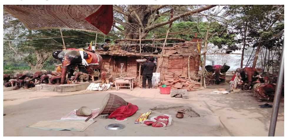
Fig 11 The Tangible aspects outside the Sami Mai temple (source Researcher)

The Tangible & Intangible aspects attached to Sami Mai temple of this Historical site. The Tangible aspects outside the Sami Mai temple (source Researcher)