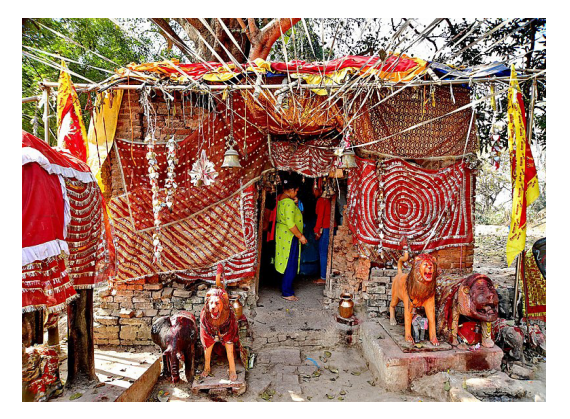
Fig 14 Fig 14b