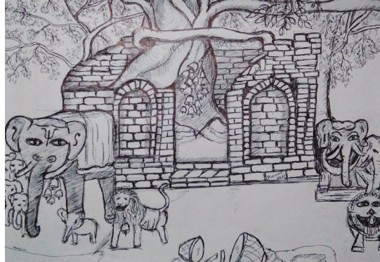
Fig 4 Fig 5

Side view of Samai Mai Temple Frontal view of Samai Mai Temple (Sketches by Researcher)