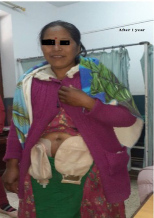
Figure 3: Pictures taken on 21^{\rm st} post operative day (First follow-up) and second picture (on right) after 1 year.

prospect of managing stoma for urine and faeces. Given the burden of cervical cancer in Nepal and late presentation needing definitive CTRT, clinicians are poised to witness increasing number of patients with recurrent disease. The aim of this case report is to bring in the awareness in cancer care that curative intent surgery is still possible in a selected group of patients with recurrent disease. In the future, surgeons should aim to perform continent urinary diversion, create neovagina and restore gastrointestinal continuity after total exenteration which will vastly improve the quality of life of these patients.