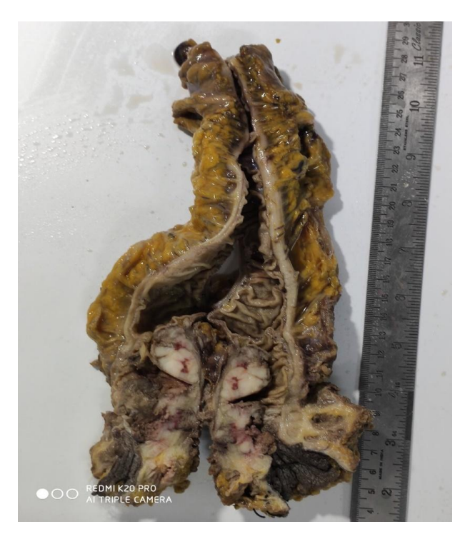
Figure.1 Gross image of rectal melanoma

lymphoma, poorly differentiated carcinoma and melanoma.