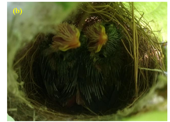
Figure 5 Eight-day old chicks (a); twelve-day old chicks in the nest (b)