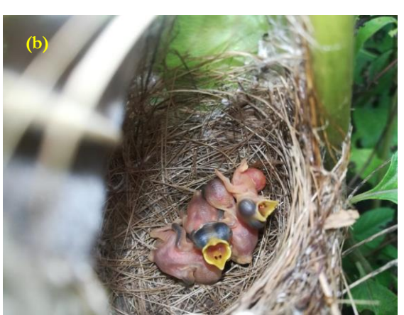
Figure 4 Nest with a clutch of eggs (4 eggs) (a); nest with four hatchlings (b)