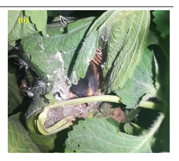
Figure 3 Whole plant of Perilla along with nest (a); side view of the Prinia nest (b)

In our study the breeding success of Ashy prinia was good because they were able to fledge out their chicks from studied nests, however all laid eggs were not able to hatch out because of accidentally lost eggs. Its breeding success was 75%. It might be due to construction of nest in weak stemed herb plants Perilla, and small nest depth, and also the immature parents who have little experiences for nest construction. Generally, the breeding success of birds is influenced by the orientation of the nest (Burton, 2006).