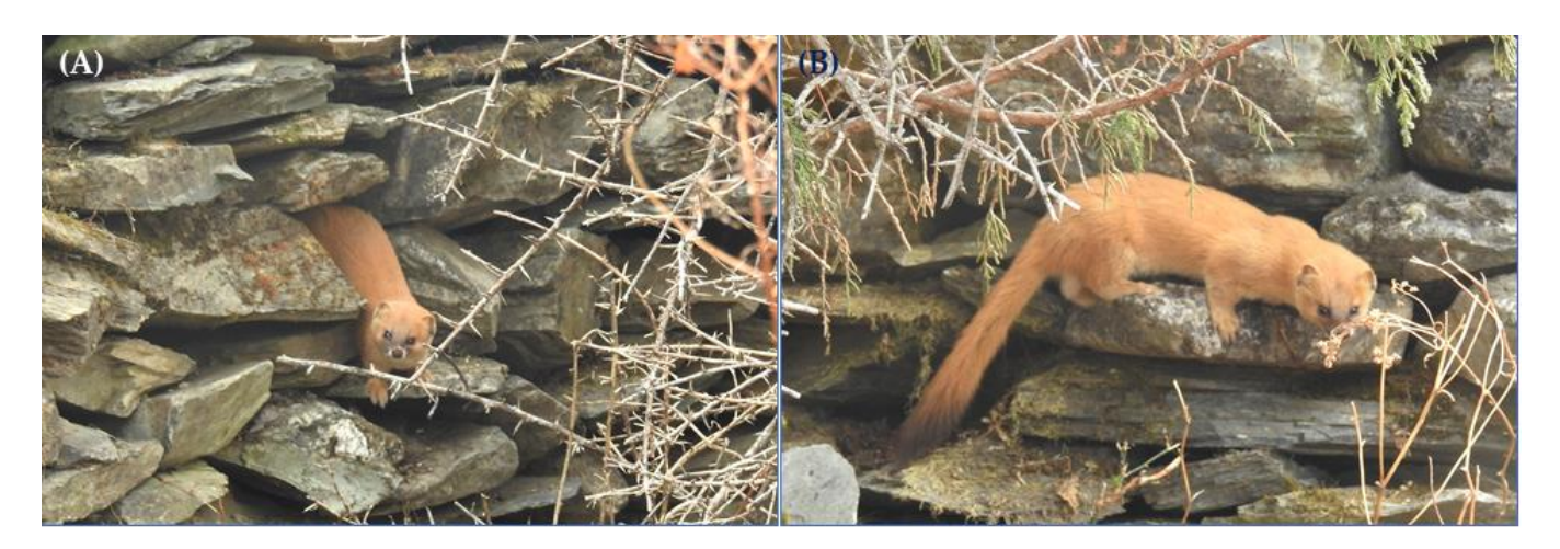
Figure 2. A, Siberian weasel coming out of stone crevices; B, Clear black tip, uniform body color, dark chocolate coloration on the snout are identifiable characteristics of the species.

The field survey was conducted in the last week of March to access the bird diversity in the Dhorpatan Valley. Three habitat types were chosen in which