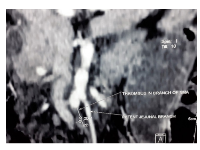
Figure 2 A and B: Computed Tomographic Angiography showing thrombus in the Superior Mesenteric Artery.

Acute Abdomen: An Enigma Shrestha DB et al