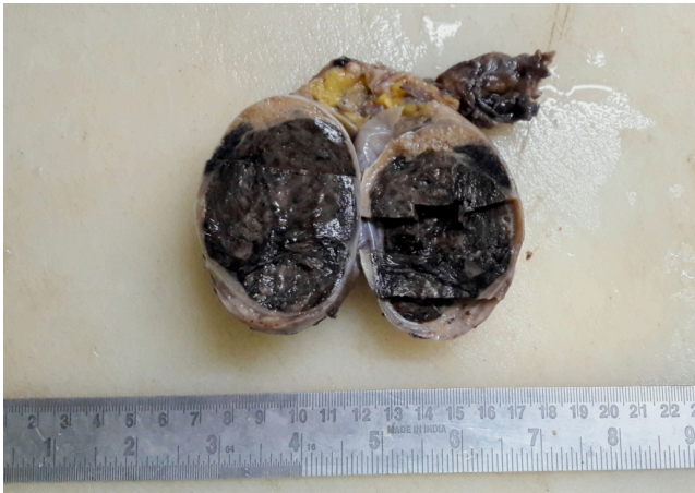
Figure 1: Orchidectomy specimen; Gross showing well capsulated solid mass with melanin pigments giving it a black homogenous appearance