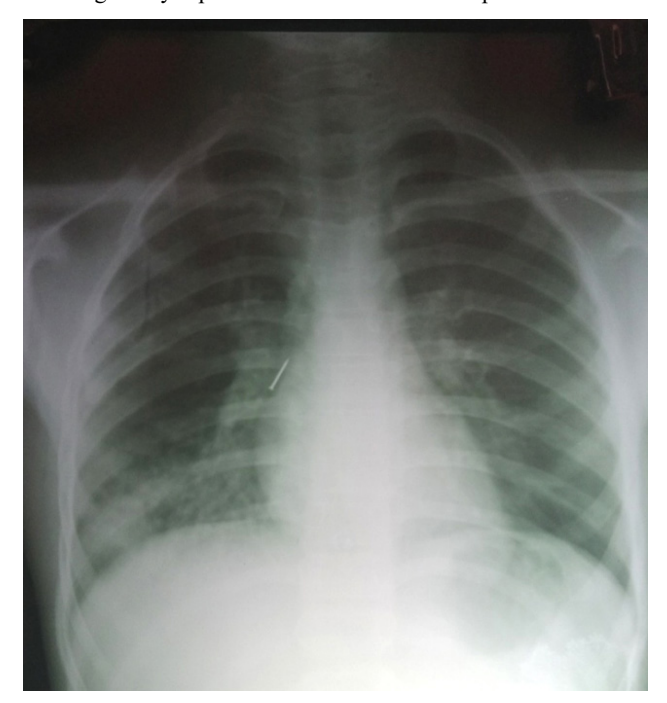
Figure 1: Chest x-ray (PA view) showing a linear hyperlucent opacity in the right pericardiac region along the course of right bronchus and right lower zone consolidation

regular, and respiratory rate was 14/min. On chest examination, inspiratory crackles with bronchial breath sounds were heard over the right infrascapular area. Other systemic examinations were unremarkable. Upon evaluation, his white blood cell count was 14,600/mm<sup>3</sup> with 80% neutrophils. His renal function and liver function were within normal limits. Chest x-ray (fig. 1) showed a well defined radiopaque linear opacity in the right pericardiac region along the course of the right bronchus. Distal to the opacity, inhomogeneous parenchymal infiltrates suggesting consolidation was seen. Diagnosis of foreign body aspiration, probably a metallic nail obstructing the distal right bronchial tree and post obstructive pneumonia of right lower lobe was made. History was reviewed again; however patient denied any history of foreign body aspiration in recent and remote past.