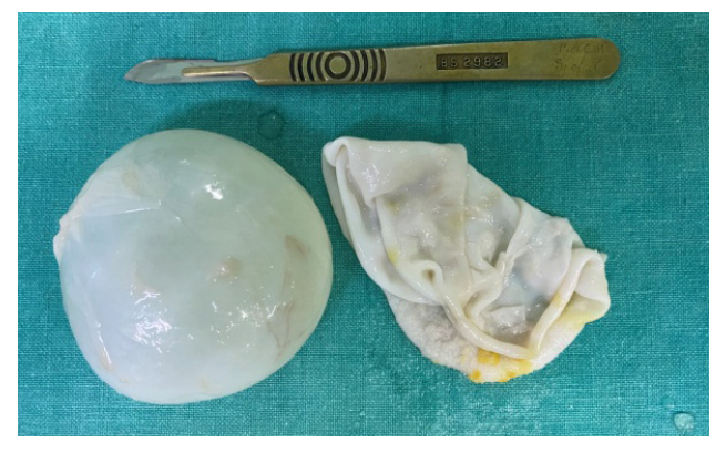
Figure 2: Cystectomy specimen