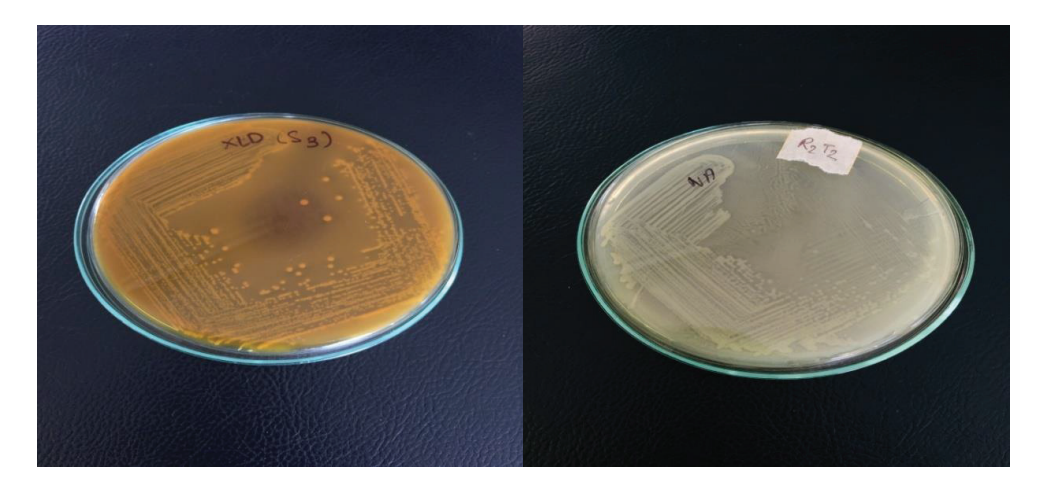
Figure 1: E.coli (Left) and Salmonella (Right) in XLD and Nutrient agar isolated from infected fish sample