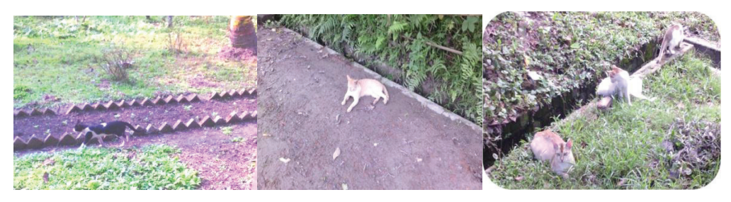
Figure 3. Cats wandering and contaminating environment at BAU area

Except tap/tubewell, all three water sources were found to be contaminated with T. gondii oocysts. Drain water was found highly contaminated in this study. In addition to take water samples, the presence of cats in those areas and their activities were observed in this study (Figure 3).