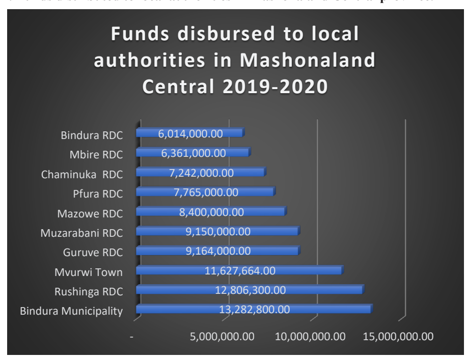
Figure 2: Funds distributed to local authorities in Mashonaland Central province.