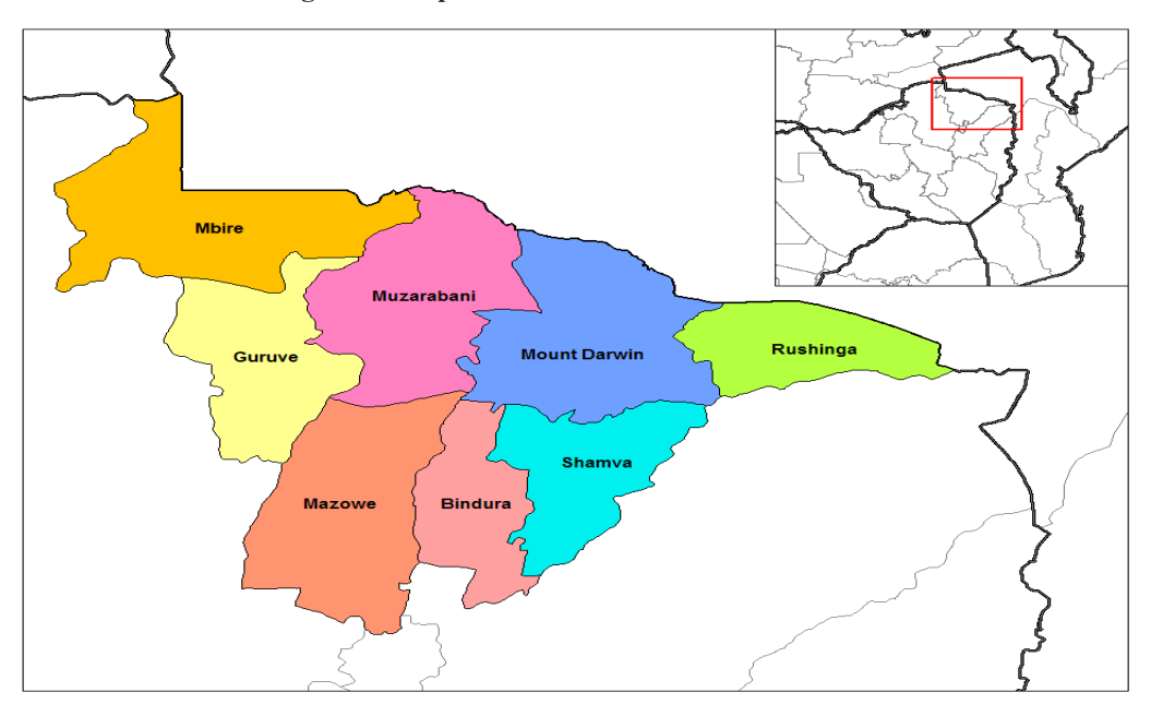
Figure 1: Map of Mashonaland Central Province

Mashonaland Central province is one of the ten administrative provinces in Zimbabwe. The province covers 28, 347 square kilometers and is located in the northeastern part of the country bordering Zambia to the north and Mozambique to the east. There are 10 local authorities in the province, two