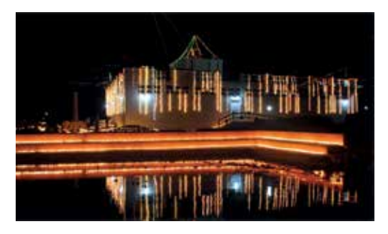
Mayadevi Temple at Night

UN, at the right time who not only floated the idea of a modern Lumbini but also put it into motion by forming the International Committee for the Development of Lumbini under Nepal's own stewardship. What else could he have done. It was another good fortune to