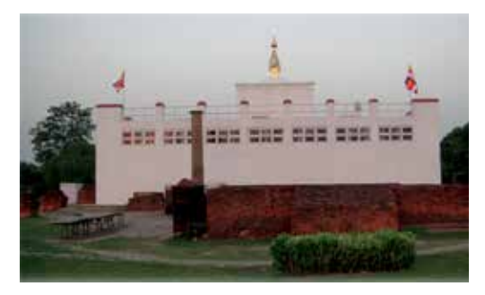
Maya Devi Temple with Asoka Pillar and the pond