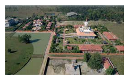
Lumbini West Monastic Zone