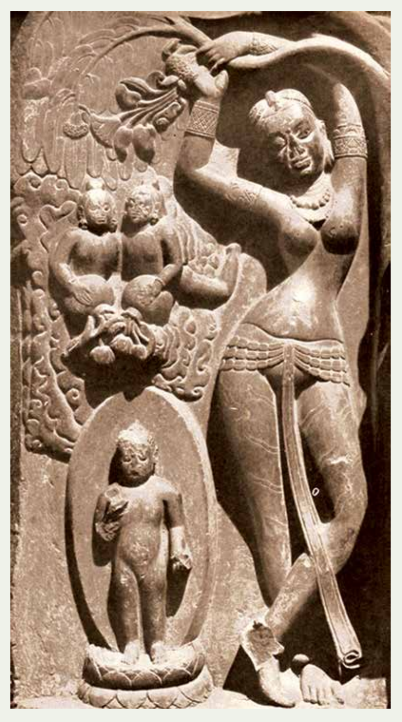
Nativity of Buddha. 9th century CE. Stone. National Museum, Chhauni, Kathmandu.