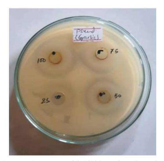
Photograph 4: Zone of inhibition of garlic against Pseudomonas spp.

Table 2: Antibacterial activity of spices extract in different percentage against test bacteria (the filter paper disc diffusion method)