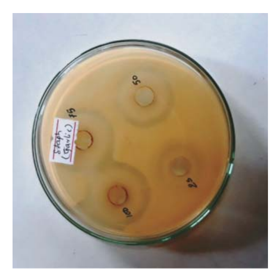
Photograph 3: Zone of inhibition of garlic against Staphylococcus aureus