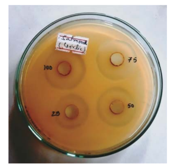
Photograph 2: Zone of inhibition of garlic against Salmonella spp.