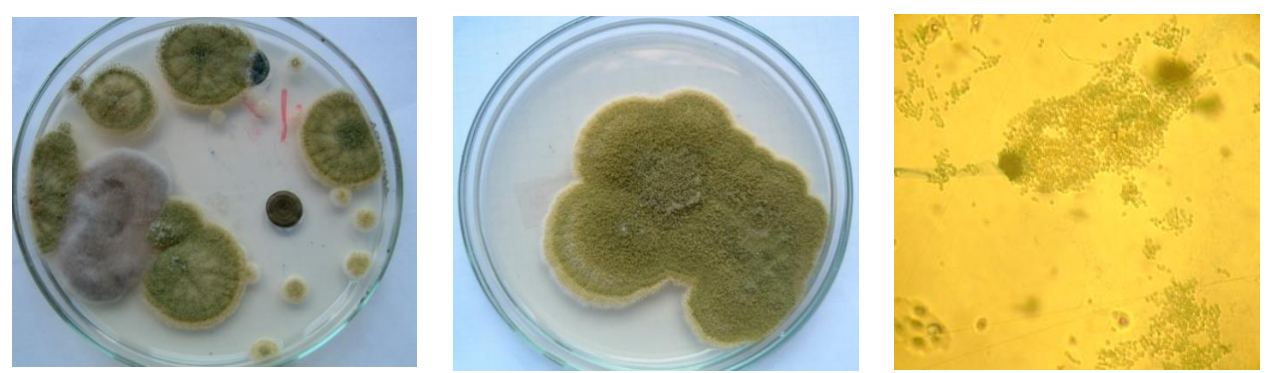
:Ptotographs (1-3) of aeromicroflora: 1) Aeromycoflora isolated by gravity plate; 2) Aspergillus fumigatus (pure culture); and 3) Aspergillus fumigatus (microscopic view)