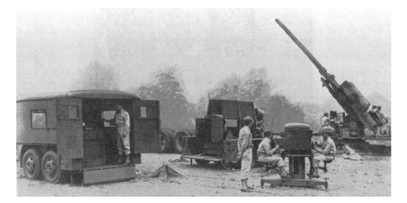
Figure 3: M-9 anti-aircraft detectors with an SCR-584 radar detector system (Mindell, 2013, p. 41)

target recognizing position indicator for anti-aircraft guns. It used electromechanical servo computing driven systems with a feedback amplification system. It utilized built-in BTL input through optical telescopes. Mindell (2013, pp. 28-29) describes the prototype which was used at Pearl Harbor. The prototype included anXT-1 tracker and SCR-584 for proper detection of stationary objects. The radar technologies was a crucial point in helping the allies secure the war against the axis power.