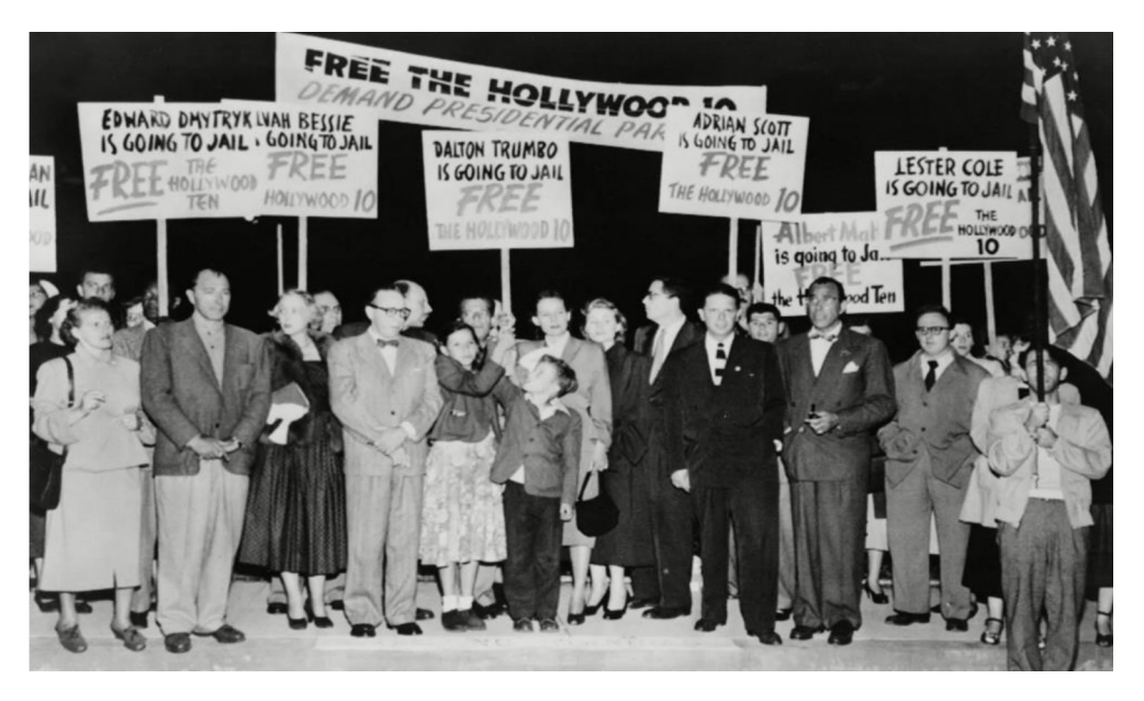
Fig. 4: The Hollywood Ten

In the Soviet Union, while Hollywood films were banned, they were widely disseminated through the black market, and support for American producers and actors was significant (Tsvetkova, 2018). In that way, the US penetrated different communities the worldwide with its politically charged narrattives. Cultural tools were once again used after the 9/11 attacks, and subsequently the invasions of Afghanistan and Iraq. The 2002 Sum of All Fears received