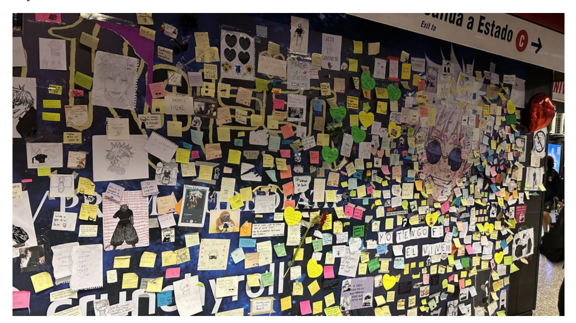
Fig. 1: Death of Satoru Gojo

uniform definition. Storey (2013) adopts three broad possibilities for defining culture: one is a general process of intellectual, spiritual, and aesthetic development; second, as a particular way of life; and then practices of creative expression as a third way (p. 21). To link popular culture and its role in the global power process (if it has any) I adopt a post-structuralist view of culture as a direct or indirect process of signifying intellectual and creative expression through any means.